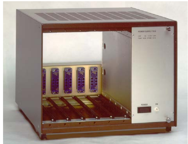
Portable NIM-BIN Model 7018/9 with PowerSupply

Test points for the DC-voltages, the ON/OFF-switch, and monitor lights for power and temperature warning are provided on the control panel. The temperature